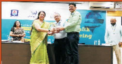
Mental Health and Mental Well-being