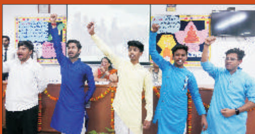
Mahatma Gautam Buddha Jayanti Celebration