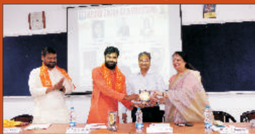
International Yoga Day Celebration