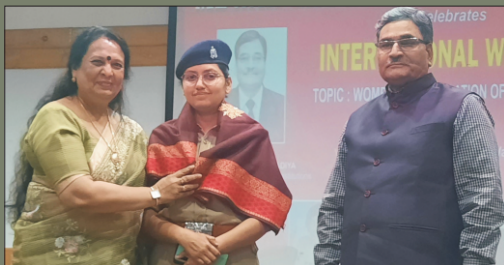
International Women's Day Celebration