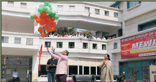
Abhivyakti 2023 Inaugration Ceremony